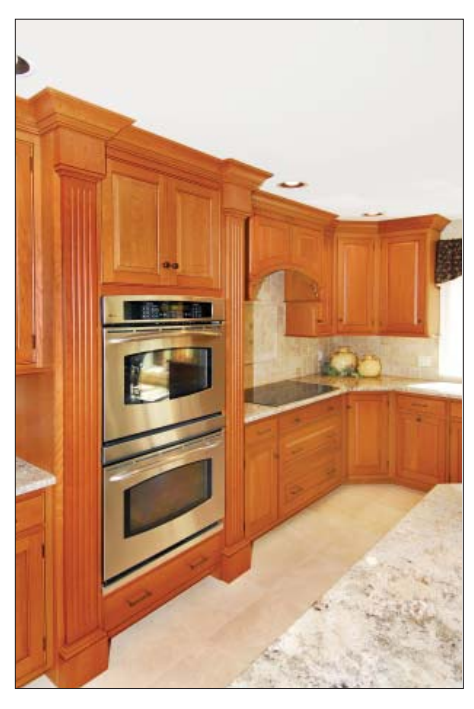
Generous work space and all the modern conveniences make this beautifully designed kitchen ideal for big productions. The benefits of the fast cooking convection oven allows for greater spontaneity in menu selections.

The floors add to the overall feel of the house by using natural materials. "Both wood and stone are natural products and anytime you use natural products, it makes for an absolutely