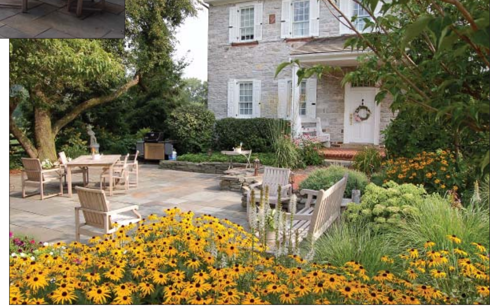
A flagstone patio was installed that is large enough for entertaining, yet proportioned appropriately to the size of the home.

The designer will also bring along photos of other projects to show you. This helps him determine, again, what you like and dislike. This is especially useful