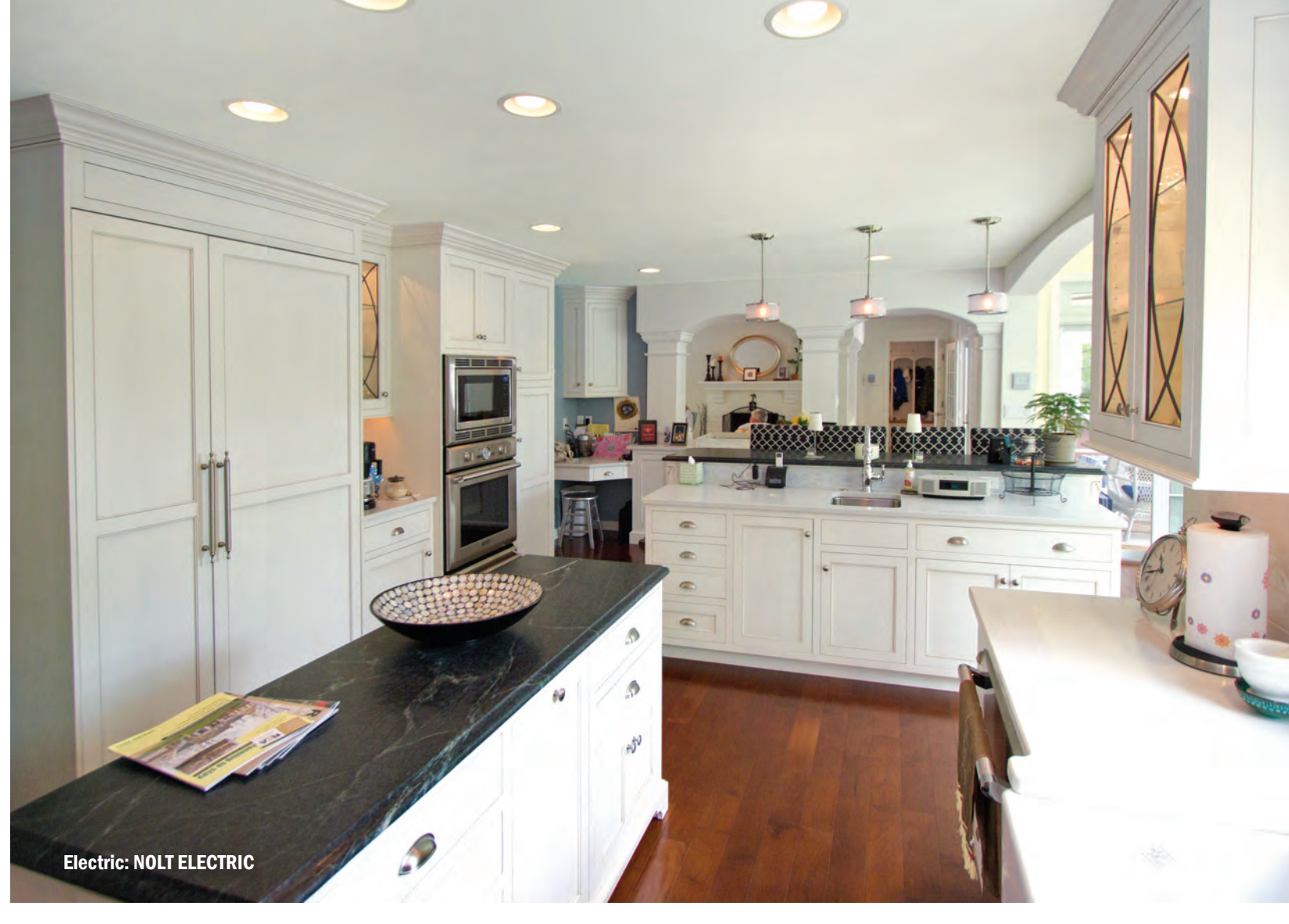
shades of light blue and generallywarm tones add welcoming touches of charm and nostalgia.