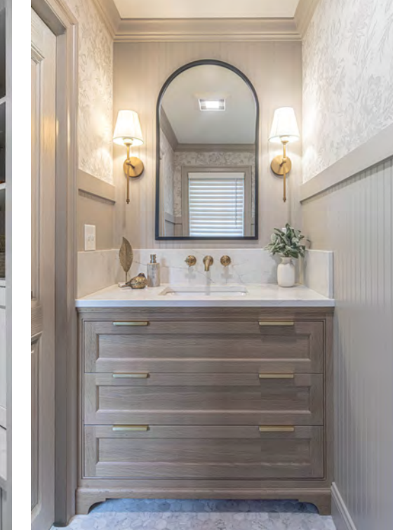
From left to right (above): Mudroom —custom cabinetry and natural wood details create an inviting drop zone that balances order and everyday function; Pantry —elegant organization meets daily practicality with marble-look surfaces and built-in storage for a polished finish; Powder Room —a compact space layered with warmth and charm, combining bead board, wallpaper, and brass accents for timeless appeal.

If you're ready to transform your space, let's create something inspiring together. At Rineer Designs , we are passionate about Crafting Sophisticated Spaces that Inspire and Uplift . Together, let's bring your vision to life!