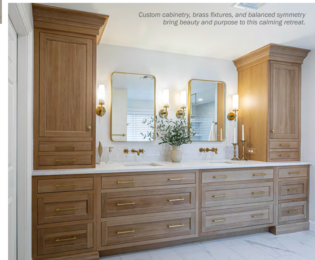
Custom cabinetry, brass fixtures, and balanced symmetry bring beauty and purpose to this calming retreat.

The freestanding soaking tub anchors the room beneath a generous window, framing a peaceful view while offering a luminous backdrop for content creation. A custom double vanity blends function with elegance, featuring built-in organization, a concealed hair-tool drawer, and brass fixtures that bring warmth to the soft neutral palette. Even the toilet alcove was planned for privacy and balance.