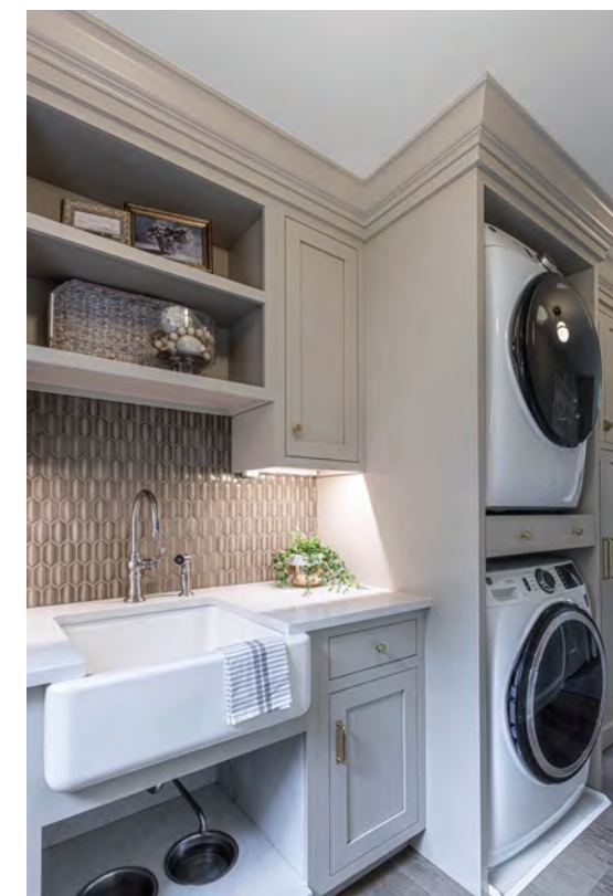
Laundry Room —a tailored workspace designed for efficiency and calm, featuring a farmhouse sink, textured backsplash, and a thoughtfully integrated dog-bowl station with its own faucet just beyond view.