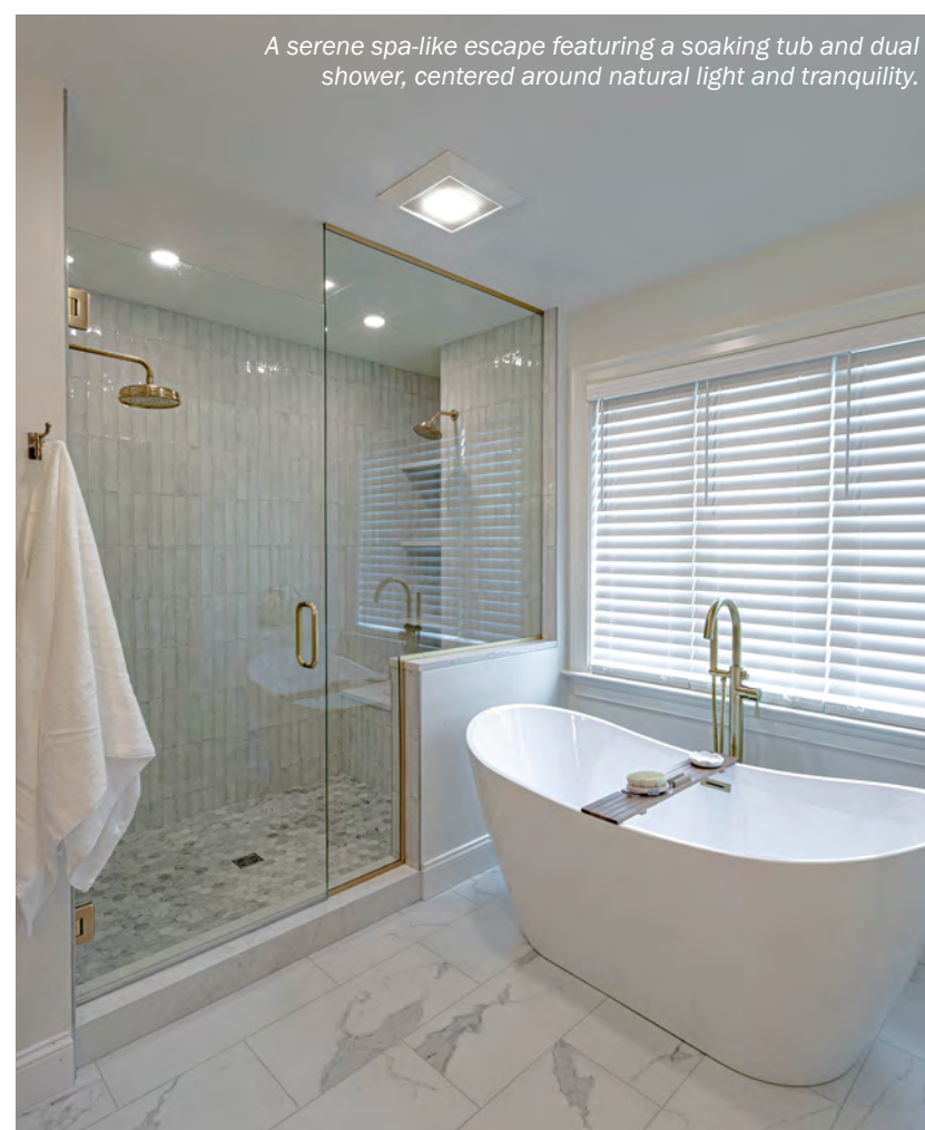
A serene spa-like escape featuring a soaking tub and dual shower, centered around natural light and tranquility.

flexibility. In future years, the home's dual-suite layout will easily accommodate guests or multigenerational living.