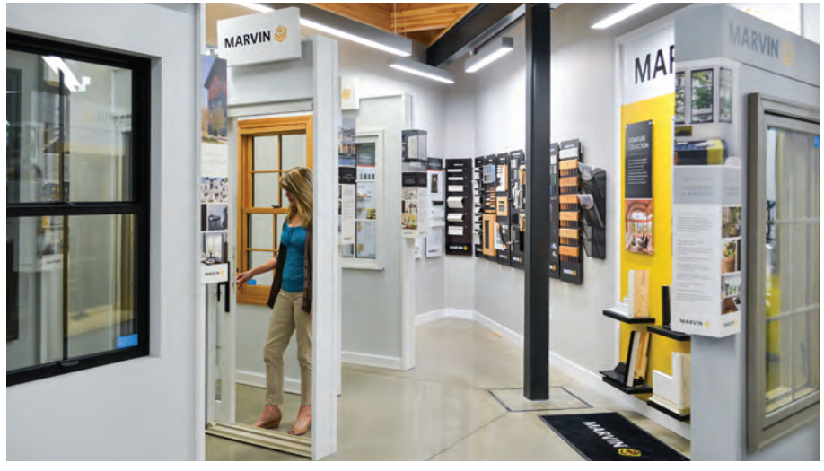
In addition to a well-appointed showroom (as seen on this page), GR Mitchell has a wide variety of selection options from the leading manufacturers along with design professionals available to assist.