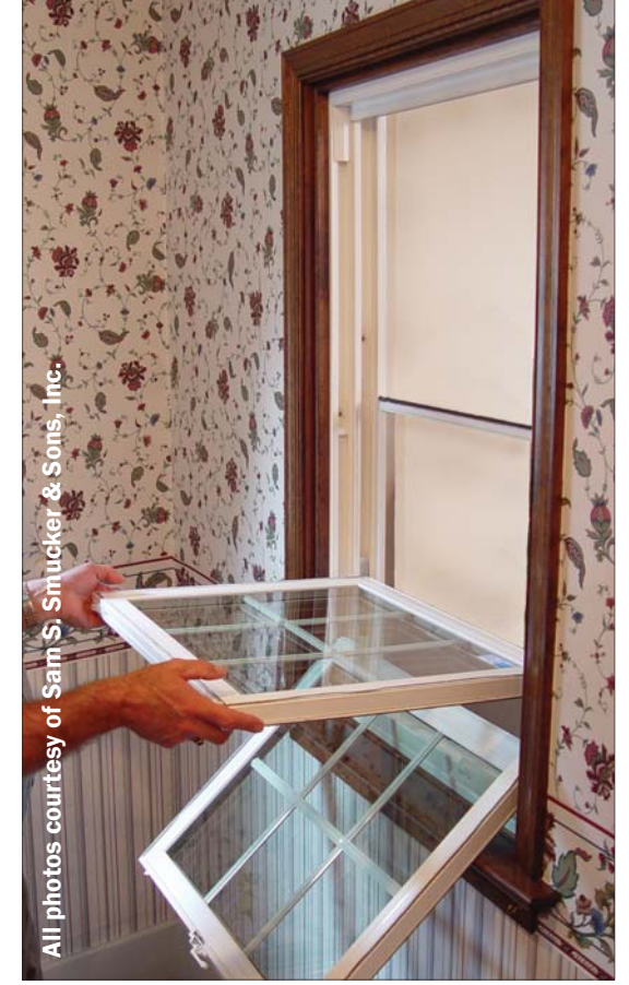
Windows tilt in for easy cleaning.

four corners, at the same time. This step absolutely ensures a true square window. And, with that process, the weld at the corner is actually stronger than the window itself, giving you a stronger, better performing window.