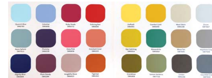
Readers of R&A are invited to visit Heritage Design Interiors to pickup a free copy of this 2009 Colormix Forecast Paint Chart.

I tell my clients that new trends are refreshing and fun but