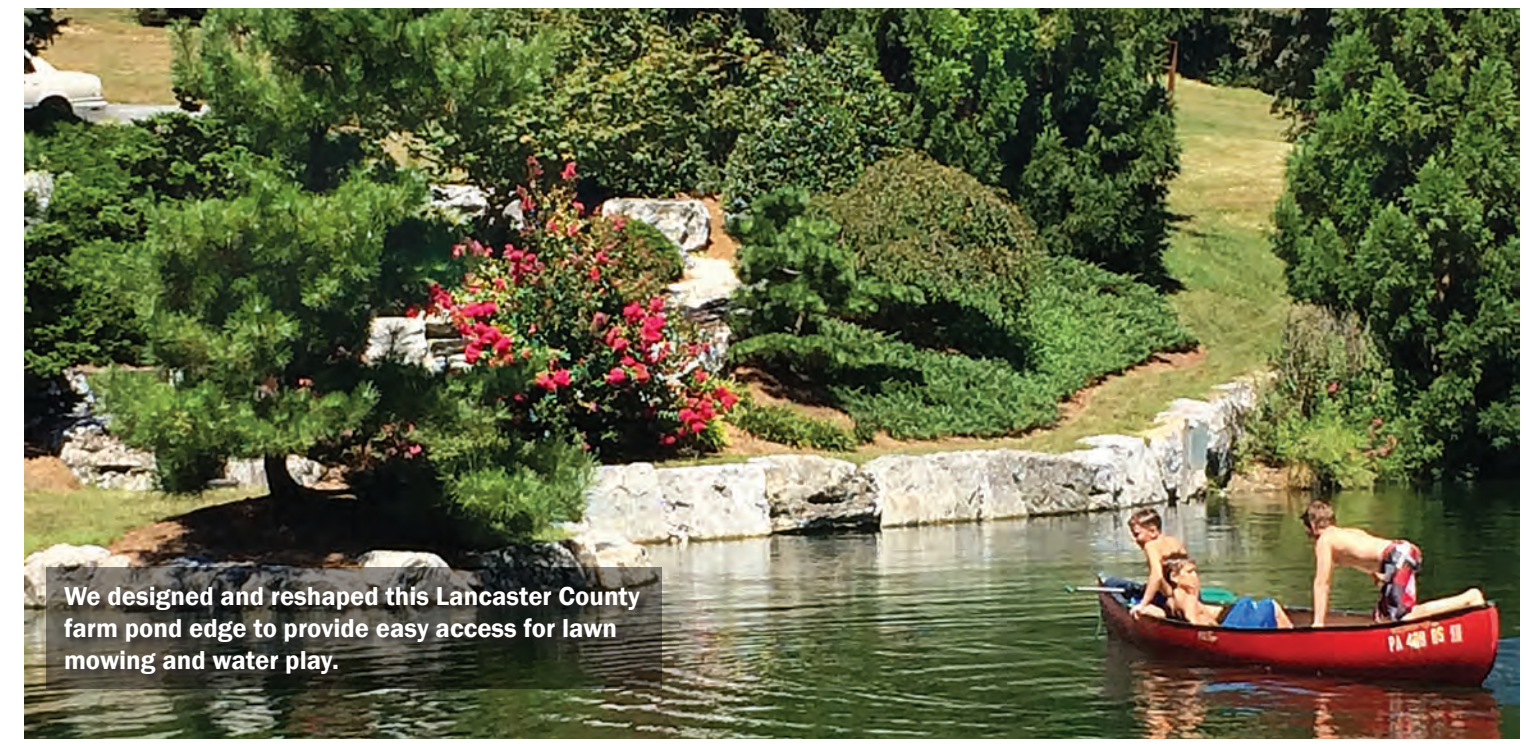
We designed and reshaped this Lancaster County farm pond edge to provide easy access for lawn mowing and water play.