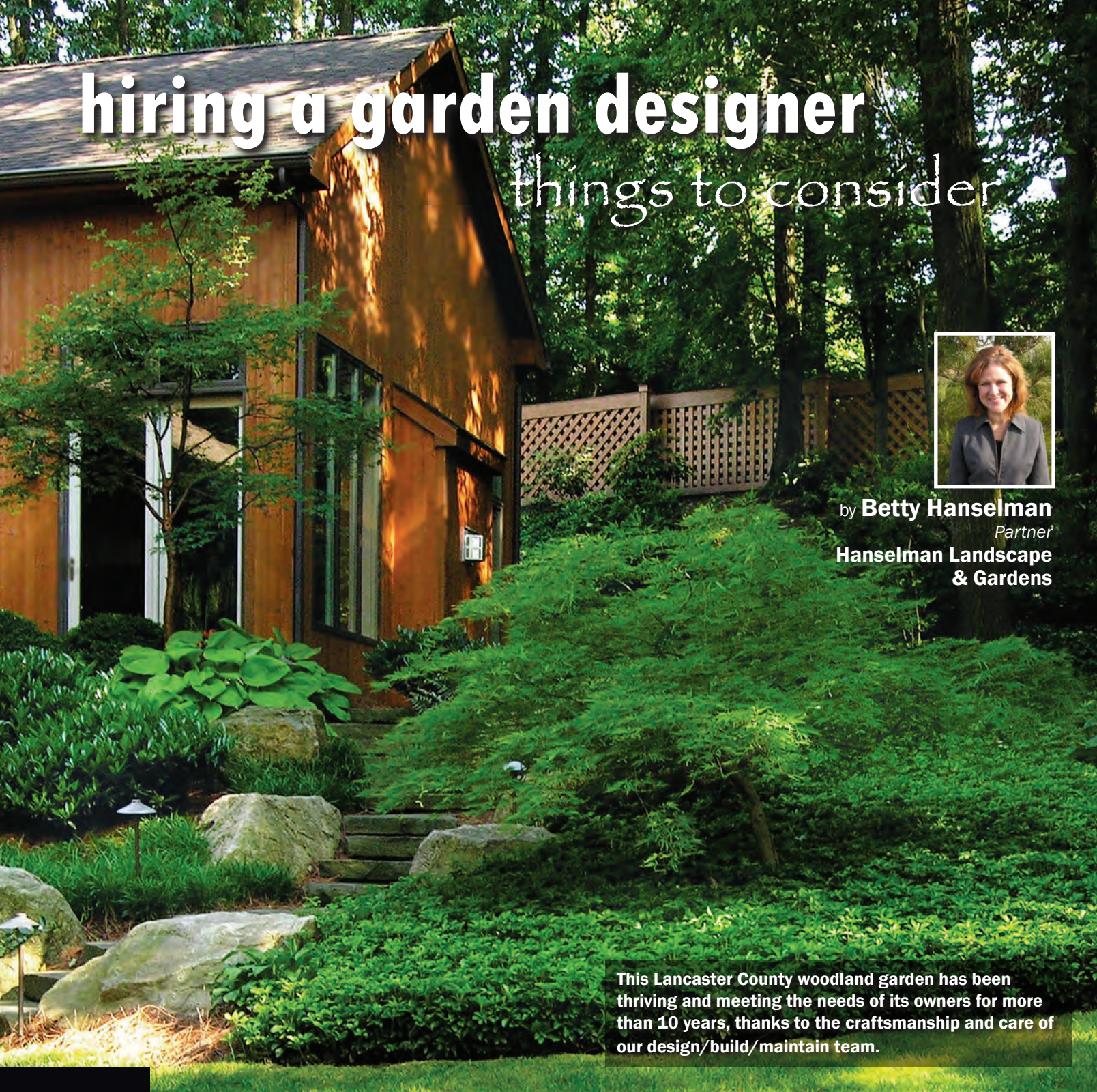
This Lancaster County woodland garden has been thriving and meeting the needs of its owners for more than 10 years, thanks to the craftsmanship and care of our design/build/maintain team.

D eveloping a garden can be a fun and rewarding process. Many people seek a professional to help them turn their garden dreams into reality. In this way, costly mistakes are avoided and the learning curve is shortened. Most importantly, since plants take time to grow to a pleasing maturity, starting right can save years of frustration.