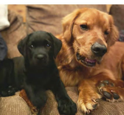
Available in many shapes, sizes, and colors. Visit a shelter today!