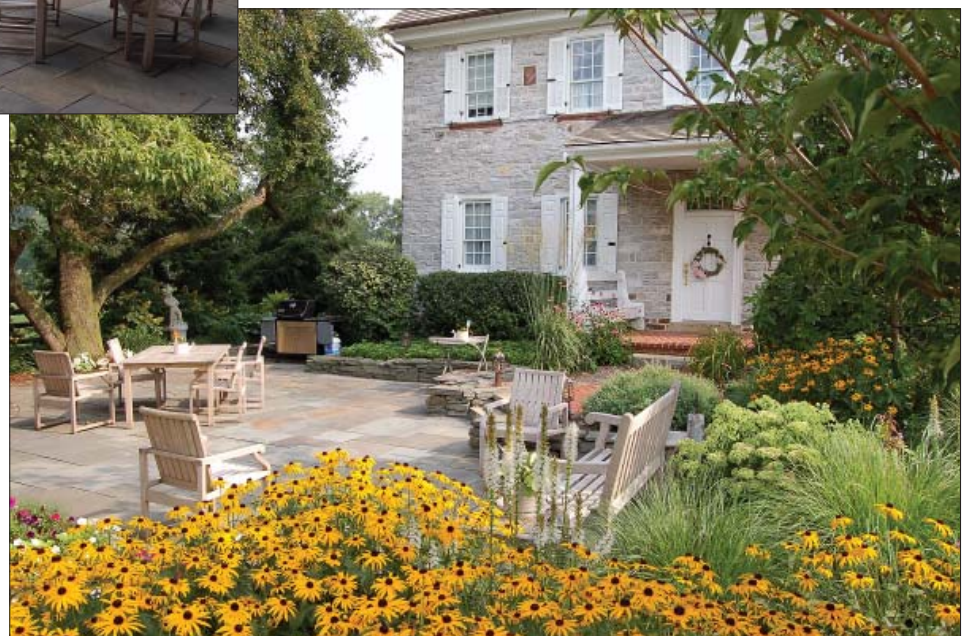
A flagstone patio was installed that is large enough for entertaining, yet proportioned appropriately to the size of the home.

The designer will also bring along photos of other projects to show you. This helps him determine, again, what you like and dislike. This is especially useful