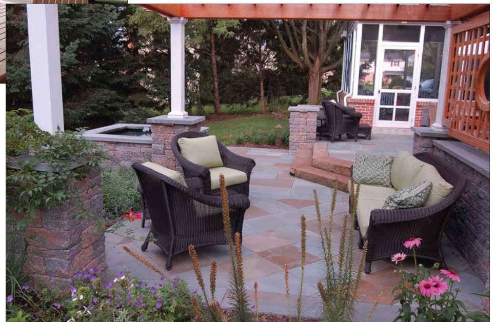
These two photos showcase an outdoor living space that was designed to have two rooms—a dining area and a more intimate conversational area under the pergola.