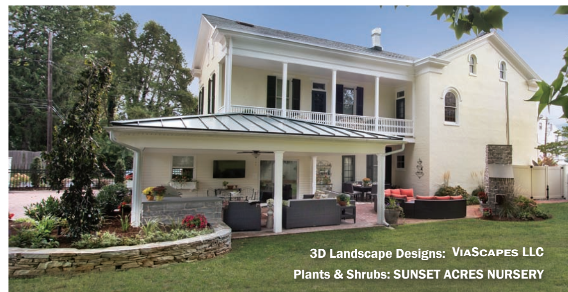
3D Landscape Designs: VIASCAPES LLC Plants & Shrubs: SUNSET ACRES NURSERY