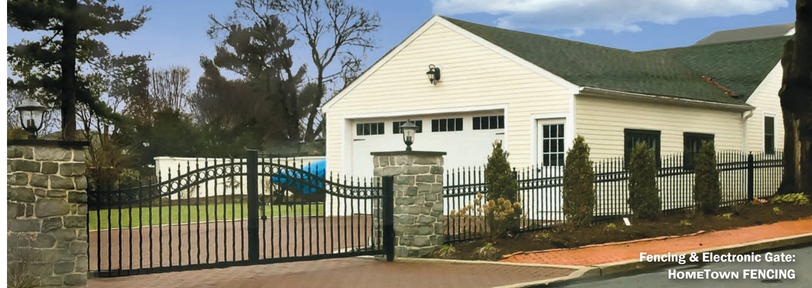
Fencing & Electronic Gate: HOMETOWN FENCING

190 WEST ROSS STREET, LANCASTER | 717.735.1922 | PENNSTONE.COM