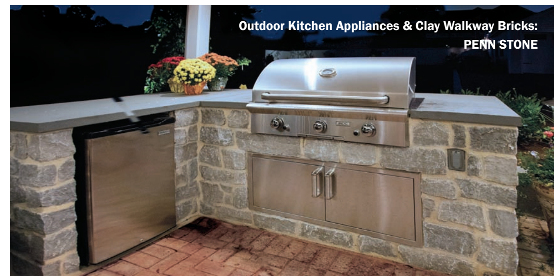
Outdoor Kitchen Appliances & Clay Walkway Bricks: PENN STONE