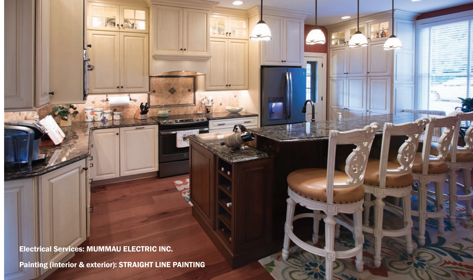
Electrical Services: MUMMAU ELECTRIC INC.

The remaining portion of the addition that the roof covered would be utilized