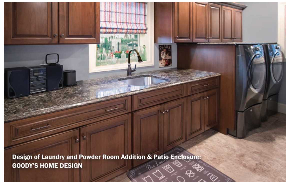
Design of Laundry and Powder Room Addition & Patio Enclosure: GOODY'S HOME DESIGN