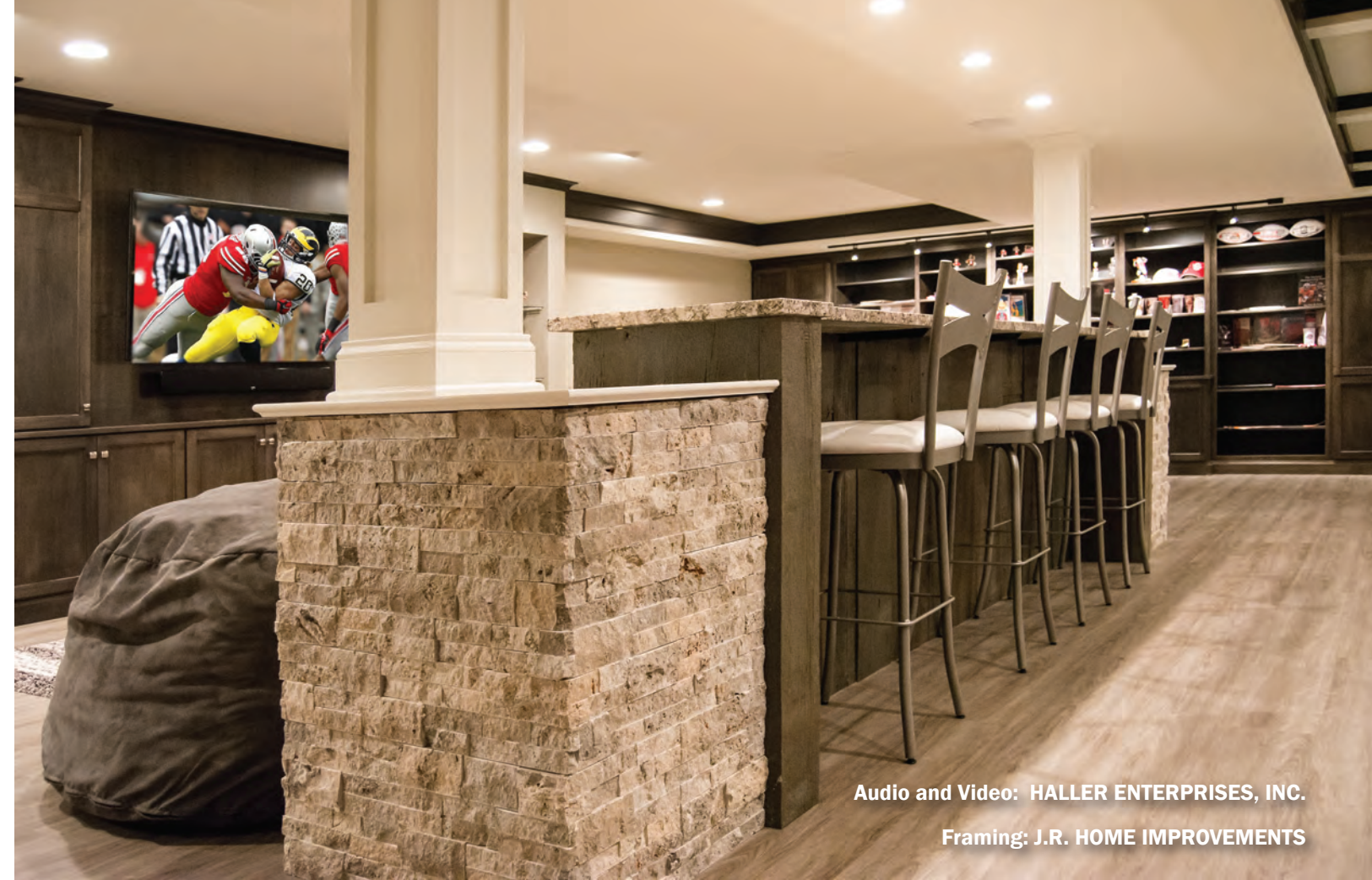
Audio and Video: HALLER ENTERPRISES, INC. Framing: J.R. HOME IMPROVEMENTS