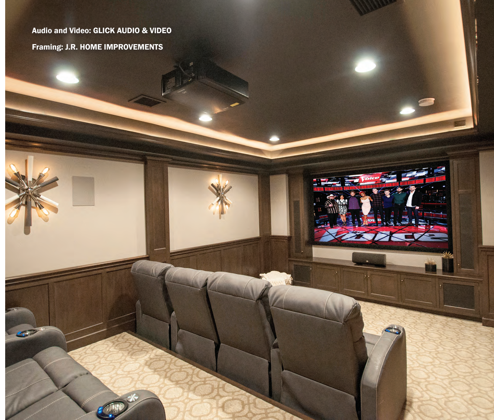
Audio and Video: GLICK AUDIO & VIDEO Framing: J.R. HOME IMPROVEMENTS