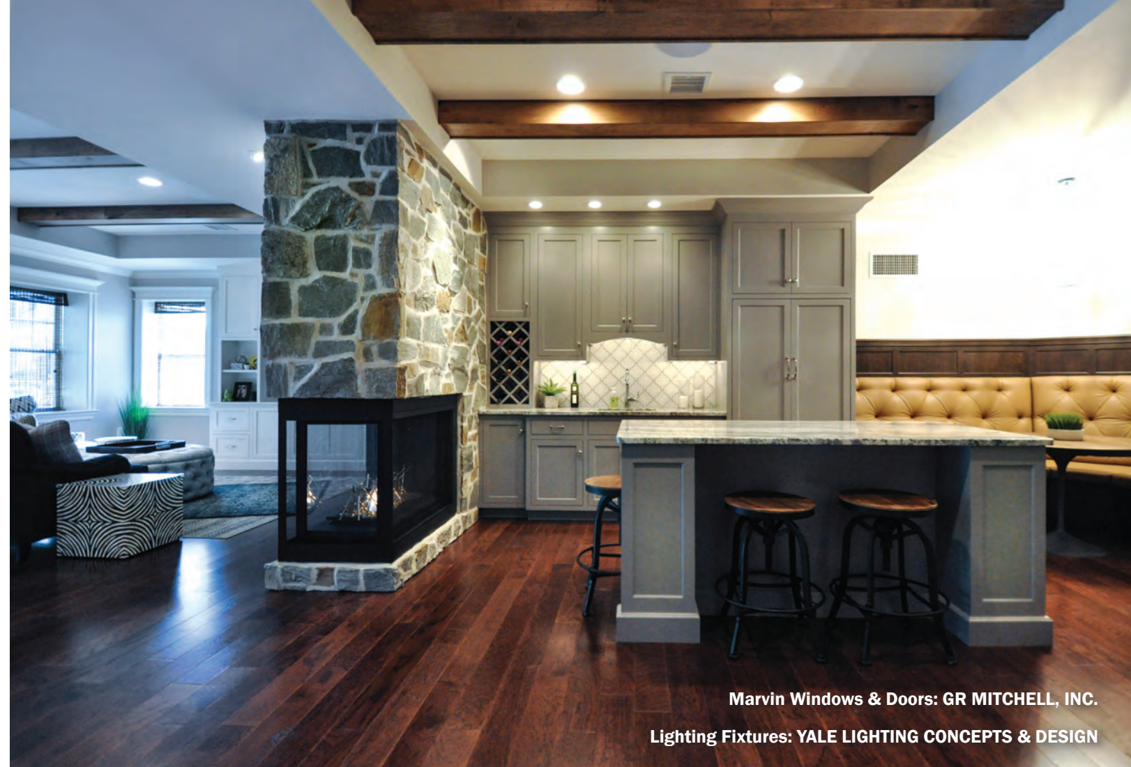
Marvin Windows & Doors: GR MITCHELL, INC.

All this and yet there was still ample storage and mechanicals in the basement. Pinnacle has mastered the design of underutilized basements to bring them to a higher level of living with style, fun, and practicality.