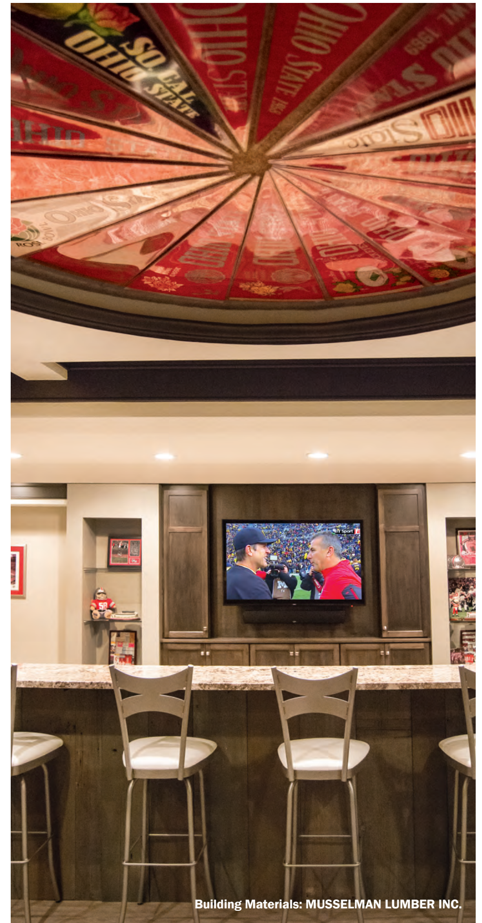
Building Materials: MUSSELMAN LUMBER INC.