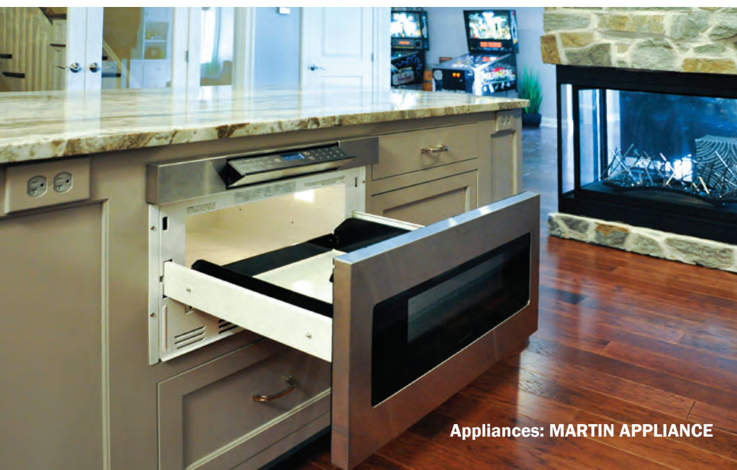
Appliances: MARTIN APPLIANCE