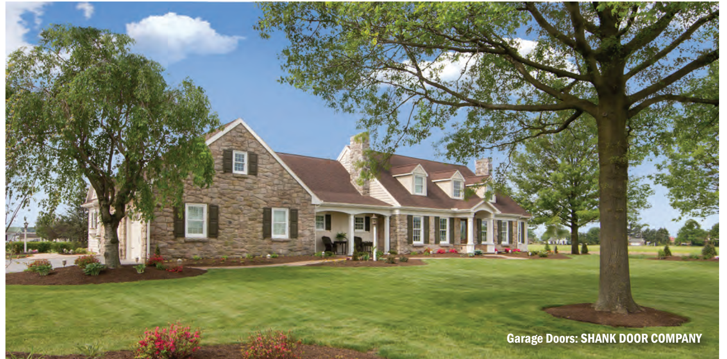
Garage Doors: SHANK DOOR COMPANY