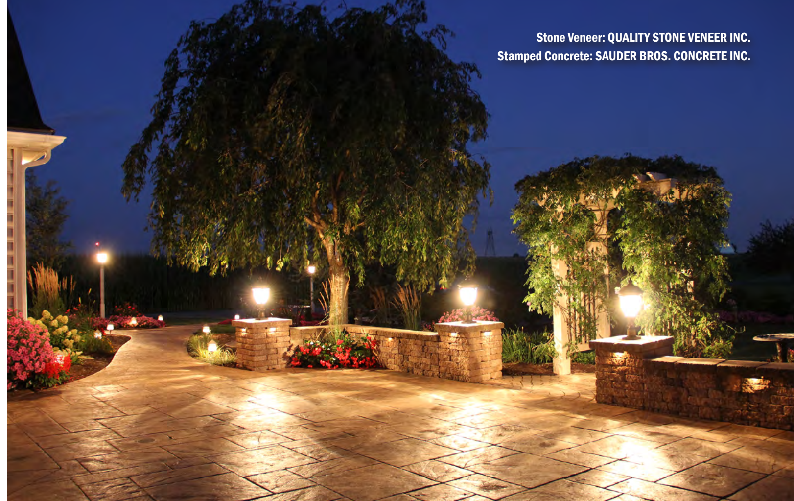
Stone Veneer: QUALITY STONE VENEER INC. Stamped Concrete: SAUDER BROS. CONCRETE INC.