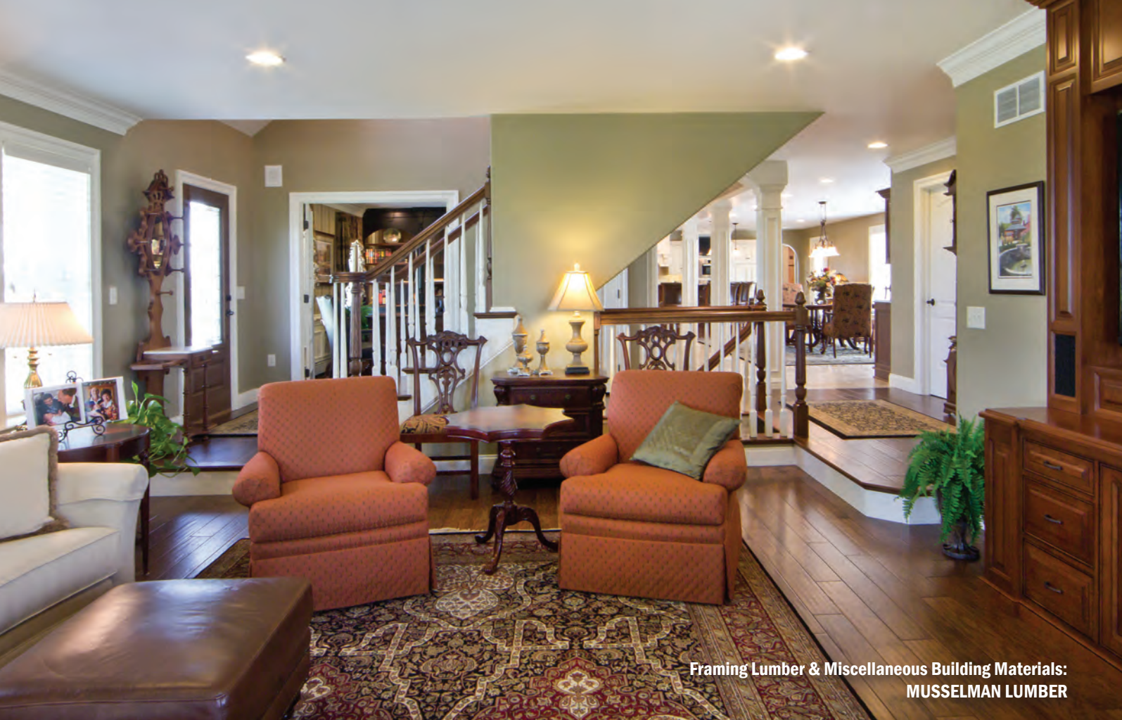
Framing Lumber & Miscellaneous Building Materials: MUSSELMAN LUMBER

friends. As it was, both areas were small and, because of their northern exposure, dark for most of the day. I love to cook but the congestion in the kitchen, especially when our kids were home, took some of the enjoyment out of it.