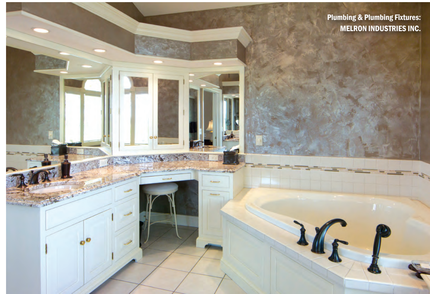
Plumbing & Plumbing Fixtures: MELRON INDUSTRIES INC.