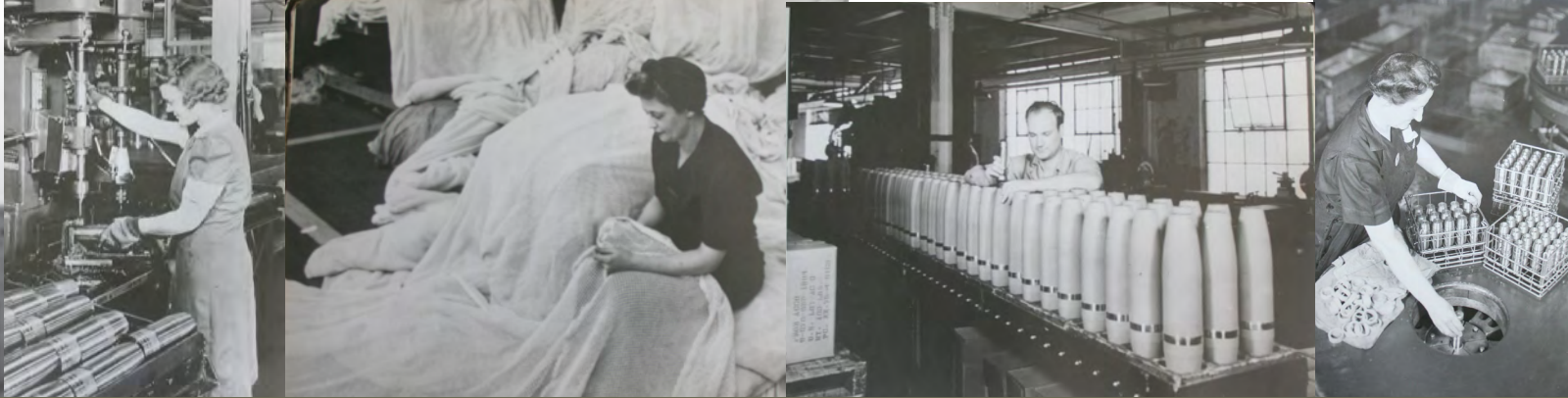
During World War II, Armstrong fulfilled many military contracts for the production of artillery shells and camouflage netting within those walls.