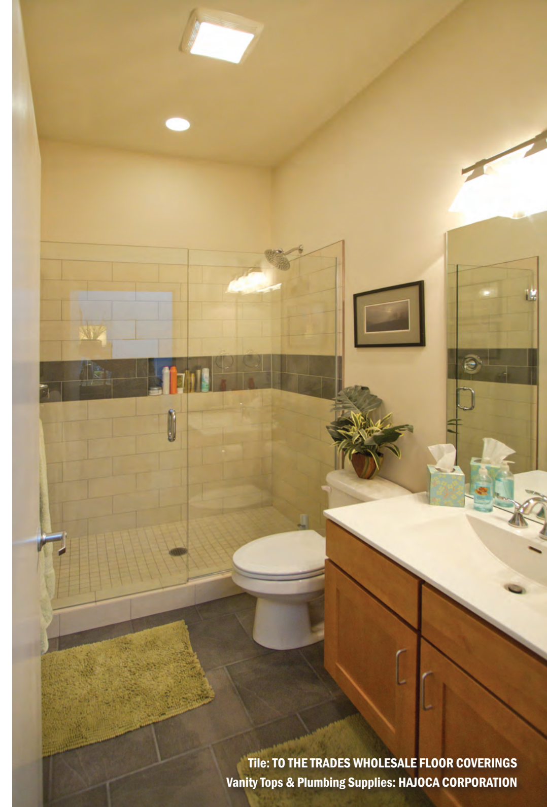
Tile: TO THE TRADES WHOLESALE FLOOR COVERINGS Vanity Tops & Plumbing Supplies: HAJOCA CORPORATION

Since the building was not originally designed with residential needs in mind, Duff Builders gave careful thought to each process of the renovation. One of the challenges faced throughout the process was how to incorporate the modern mechanical systems with the existing building and its support beams without taking away from the aesthetics of the original