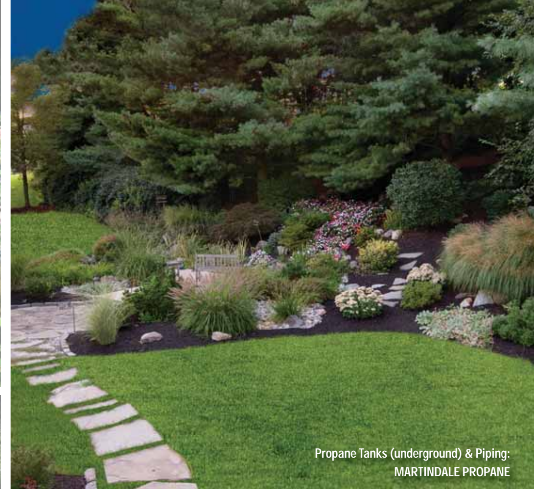
Propane Tanks (underground) & Piping: MARTINDALE PROPANE