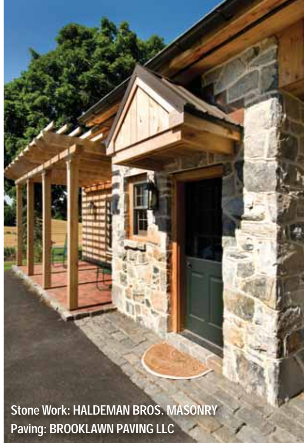
Stone Work: HALDEMAN BROS. MASONRY Paving: BROOKLAWN PAVING LLC