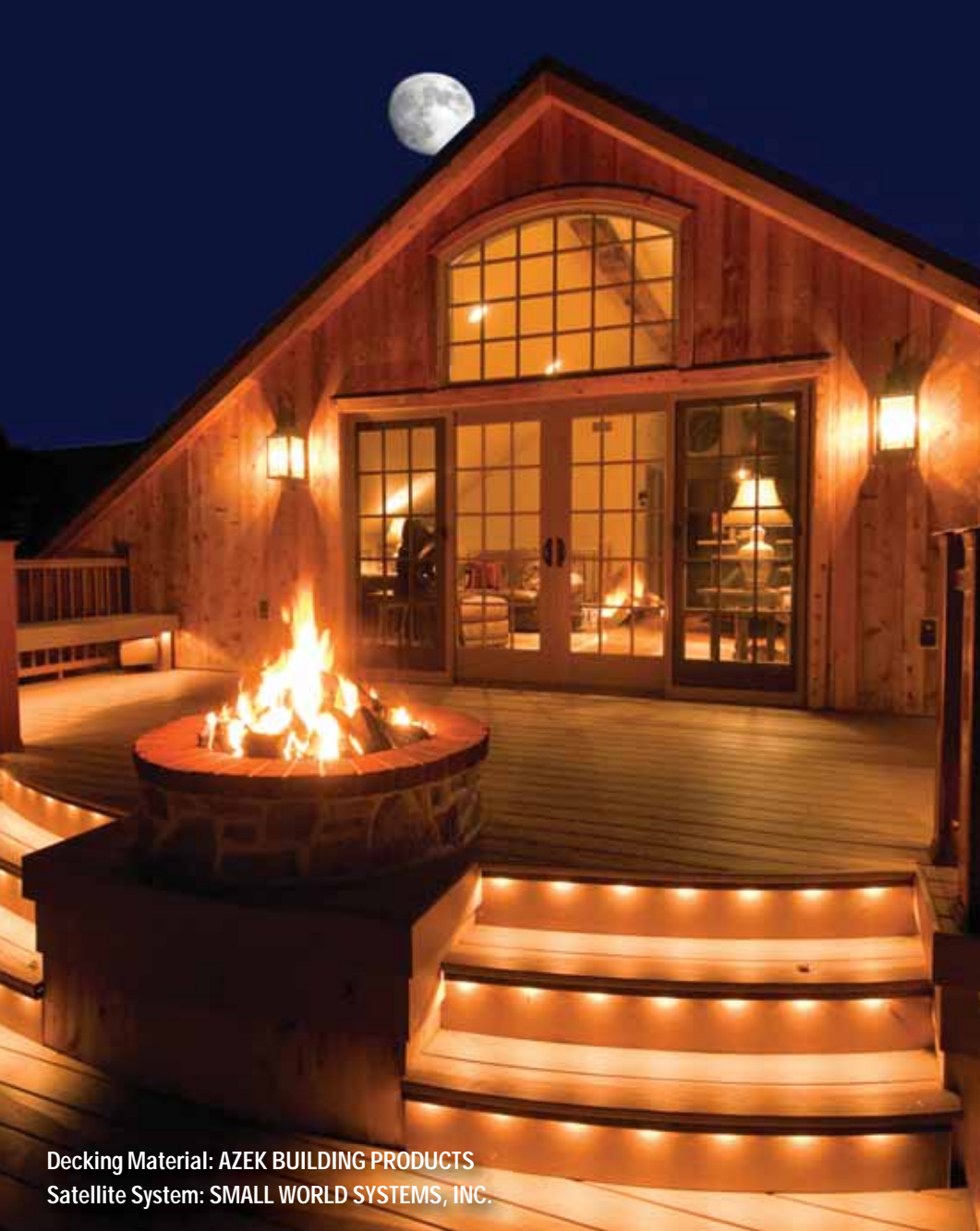
Decking Material: AZEK BUILDING PRODUCTS Satellite System: SMALL WORLD SYSTEMS, INC.

at home. The inviting custom fire pit with gas logs is centrally located to be enjoyed from many perspectives, including the built-in benches that surround the perimeter of the deck. The deck's wide staircases lead down to the lower level grilling area and picturesque landscaping. The grounds were beautifully restored and showcase a pond with an observation deck and waterfalls.