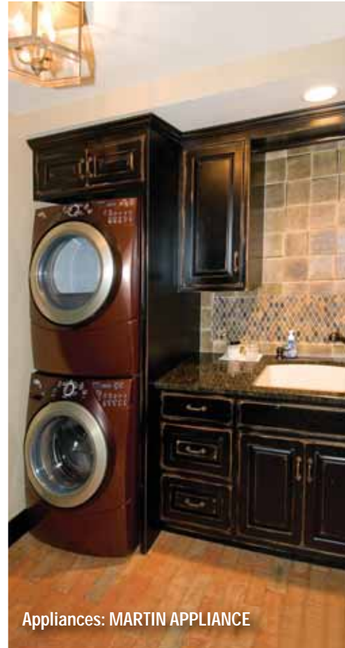
Appliances: MARTIN APPLIANCE

Drop into our showroom, or visit our virtual laundry room at ElectroluxAppliances.com