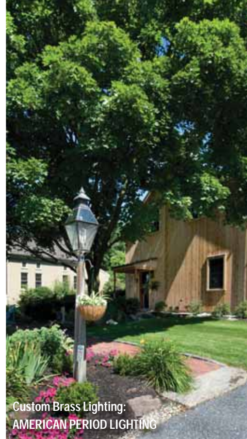
Custom Brass Lighting: AMERICAN PERIOD LIGHTING

Dale saw what we were dealing with, he knew we needed a space!"