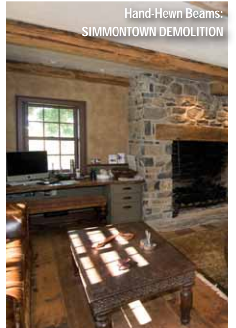
Hand-Hewn Beams: SIMMONTOWN DEMOLITION

For example, when Tim and Kelly decided to expand the deck area, they were able to address a location for the generator they wanted and create a dog pen for their three large dogs. The owners did not start off by saying, "We have to have a dog pen." But, it just came together. Kelly laughs, "I think when we unloaded those dogs and