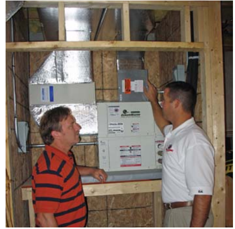
A Haller Comfort Consultant reviews with the homeowner the operations of a newly installed ClimateMaster geothermal system.

Today there are more than 1 million residential geothermal installations in the U.S. The current use of geothermal heat pump technology is equivalent to taking more than 1.29 million cars off the road, or planting more than 384 million trees.