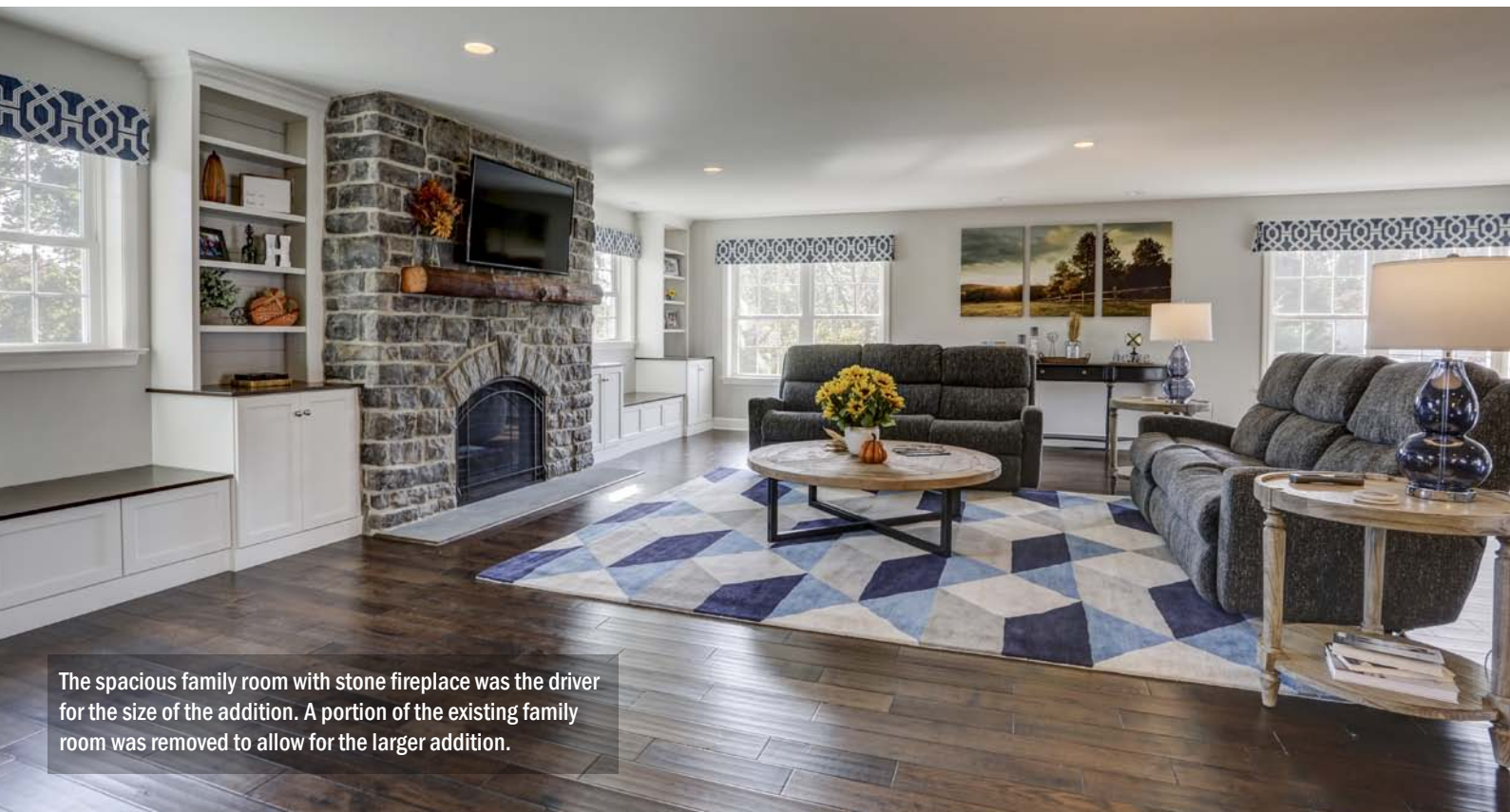
The spacious family room with stone fireplace was the driver for the size of the addition. A portion of the existing family room was removed to allow for the larger addition.

This two-story addition project adds over 2,000 square feet. It includes an expansive family room and grandiose kitchen, including an island that seats seven, on the first floor. The second floor includes a laundry room, extra storage, and two kids' bedrooms with private baths. A second staircase (far right top photo) allows ease of access to the home's 5,400 square feet of finished space.