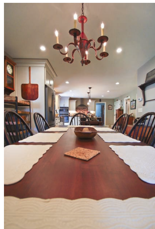
The new open floor layout—again, made possible by removing the wall separating the original kitchen and dining room—is considerably more conducive to holiday family gatherings.