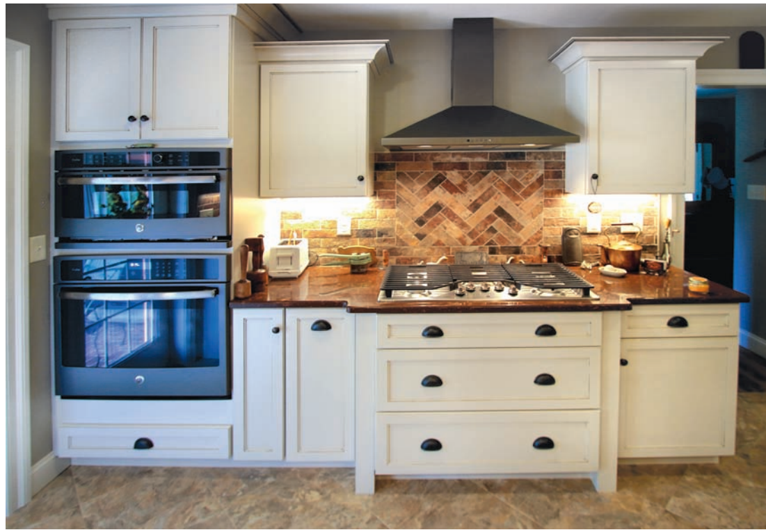
Kitchen Appliance Specifications by Martin Appliance

GE Profile Series including: Built in Microwave/Convection Oven; 30" Single Wall Over with Convection (Slate); Gas Cooktop; French Door Refrigerator; and Dishwasher. GE 36" Chimney Hood (Slate).