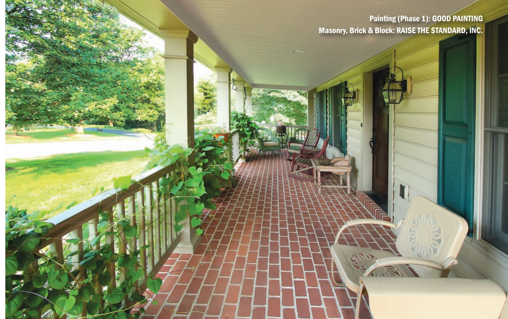
Painting (Phase 1): GOOD PAINTING Masonry, Brick & Block: RAISE THE STANDARD, INC.

W ith us living at home during both projects, we were very impressed on how well Middle Creek managed things and went out of their way to make it easy for us. They established a work schedule early on and, with a few minor deviations, they kept to it. What was really appreciated was how respectful they were to us and our schedule and how thoroughly they and their subcontractors cleaned things up at the end of each day.