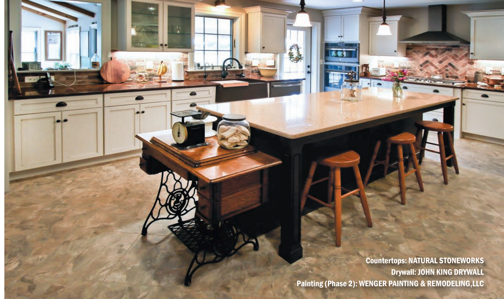
Countertops: NATURAL STONEWORKS Drywall: JOHN KING DRYWALL Painting (Phase 2): WENGER PAINTING & REMODELING, LLC