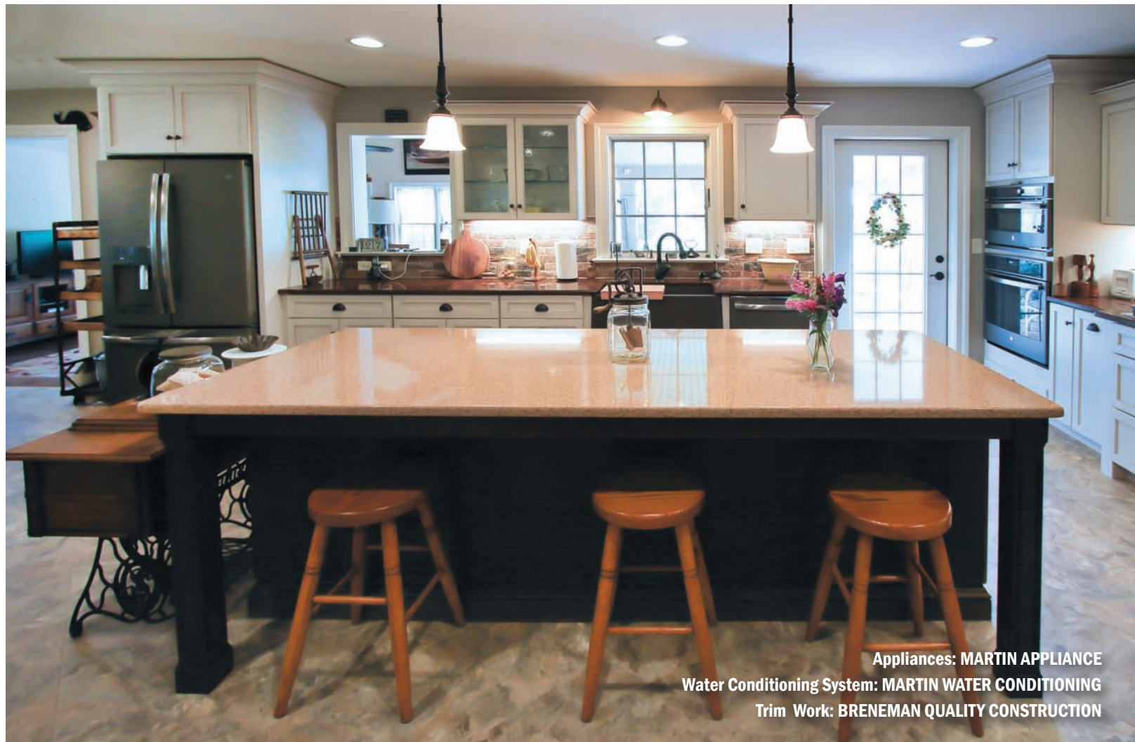
Appliances: MARTIN APPLIANCE Water Conditioning System: MARTIN WATER CONDITIONING Trim Work: BRENEMAN QUALITY CONSTRUCTION

www.martinsappliance.com www.martinfurniturepa.com www.martinwater.com