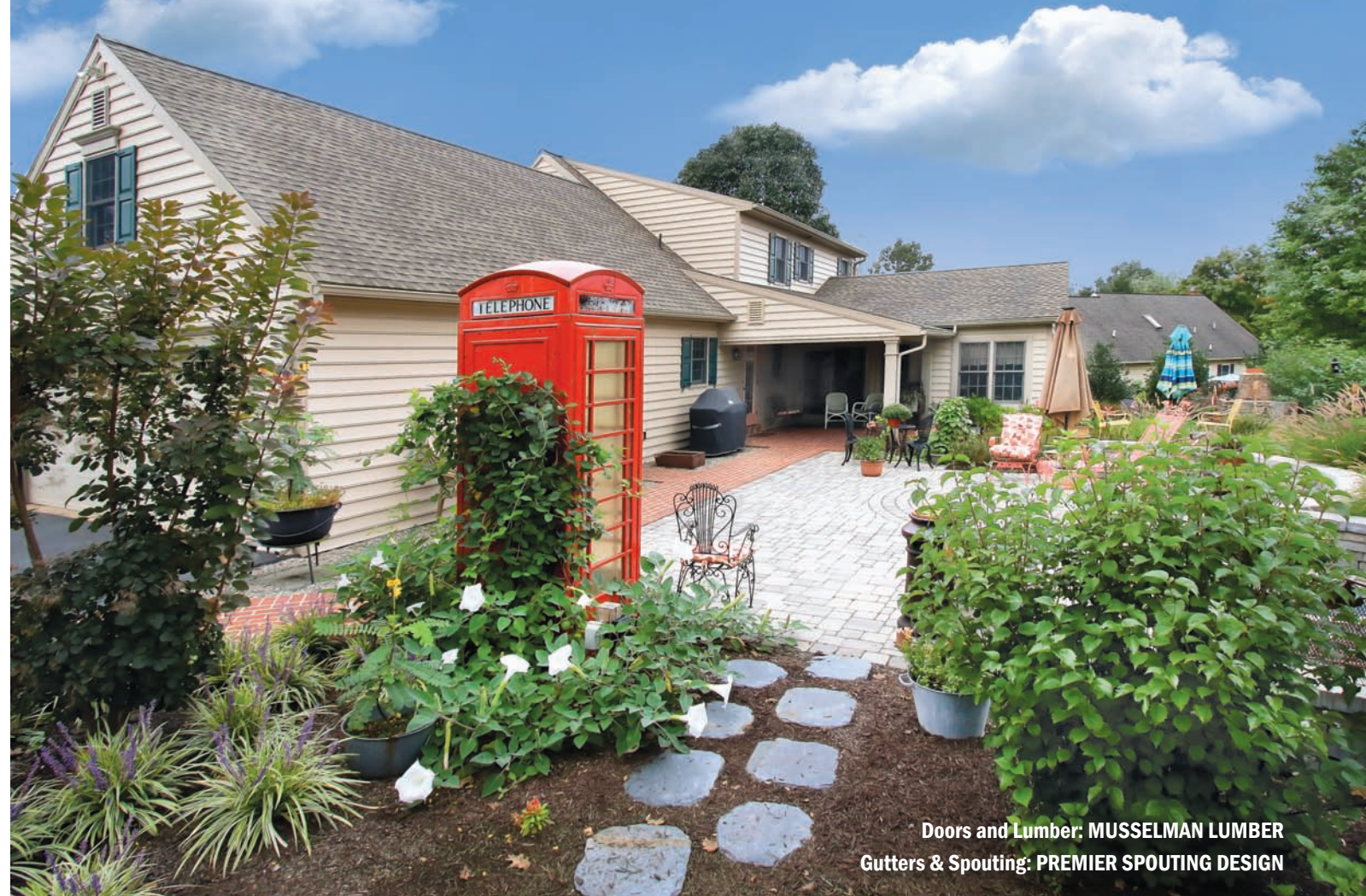
Doors and Lumber: MUSSELMAN LUMBER Gutters & Spouting: PREMIER SPOUTING DESIGN

This restored British "phone box" is the real McCoy. The homeowners had it shipped from England.