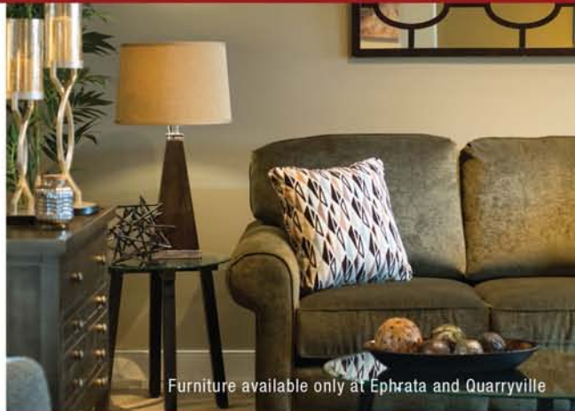
Furniture available only at Ephrata and Quarryville

SOFAS • LOVESEATS SECTIONALS • OTTOMANS RECLINERS • CHAIRS LIFT CHAIRS • BEDDING BEDROOM SUITES MATTRESSES