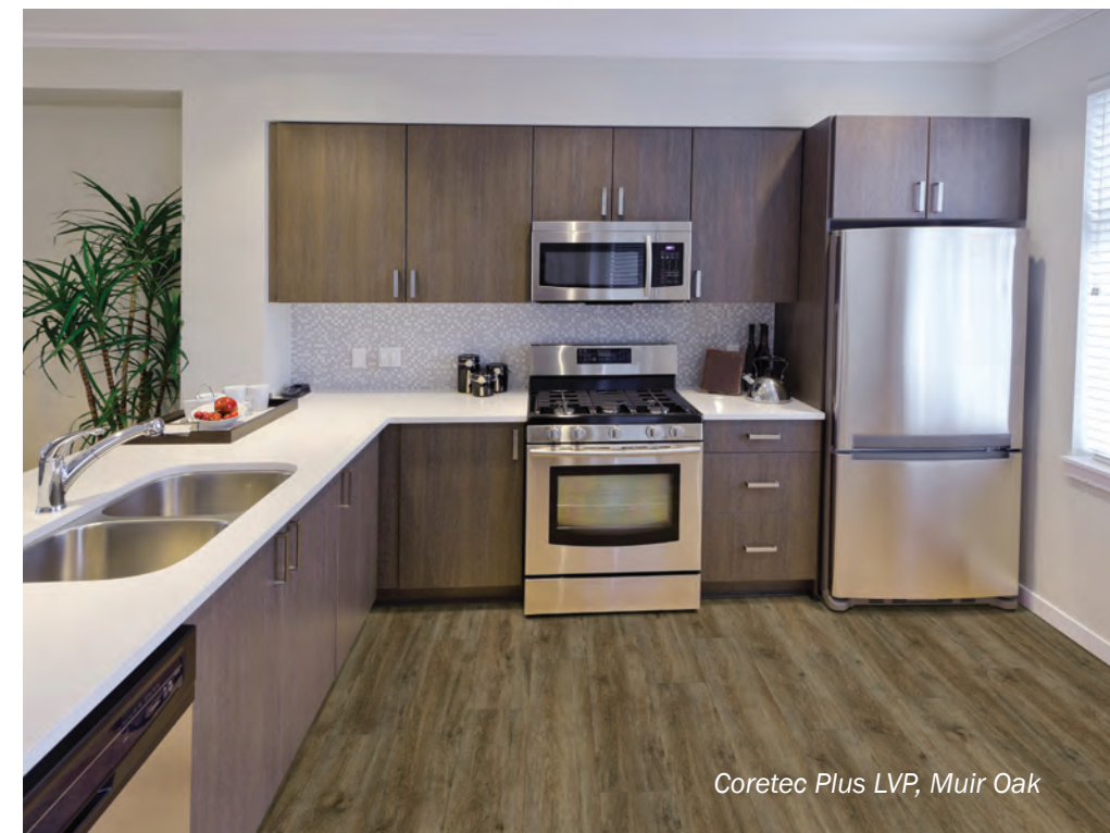
Coretec Plus LVP, Muir Oak

W hen we think of vinyl flooring, our minds often think of that shiny sheet vinyl that once was the staple for flooring in most kitchens and baths in America. Today, that image is no longer totally accurate. Kitchens and baths have become the focal point for style and design for today's homeowner, and the flooring options available today reflect that trend.