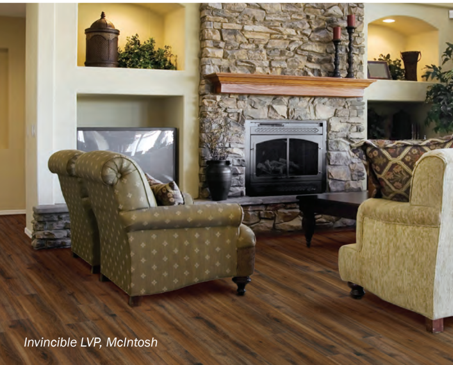
Invincible LVP, McIntosh