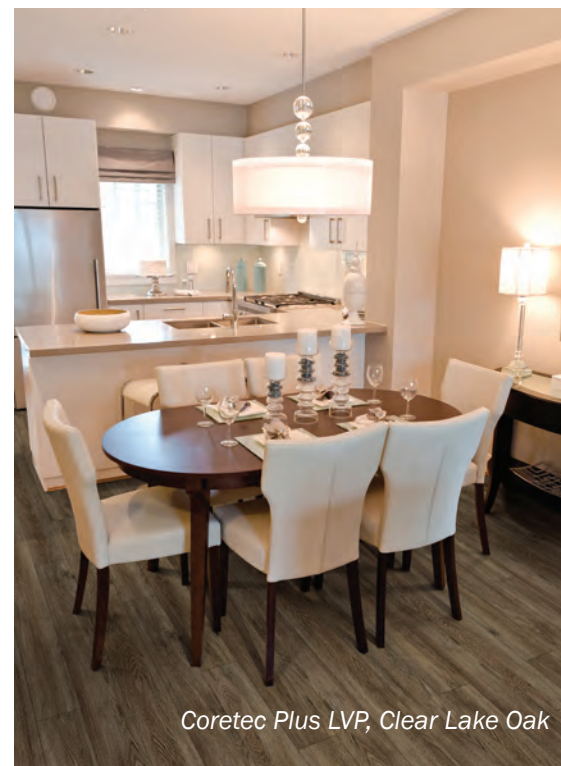
Coretec Plus LVP, Clear Lake Oak