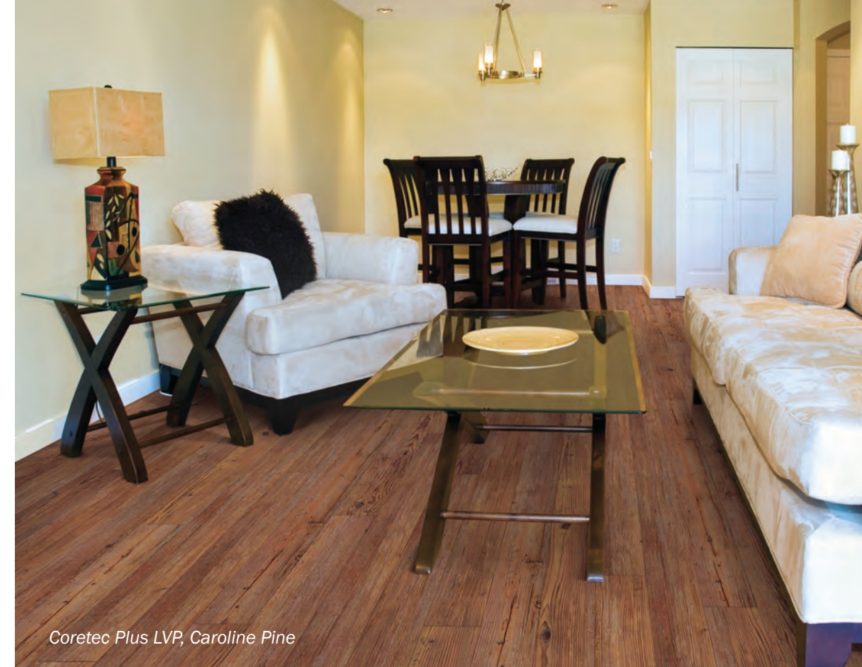
Coretec Plus LVP, Caroline Pine