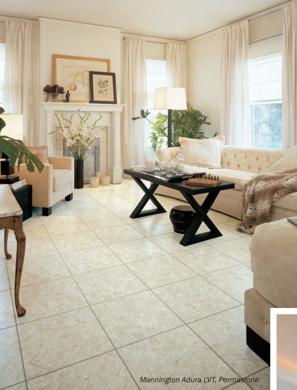
Mannington Adura LVT, Permastone