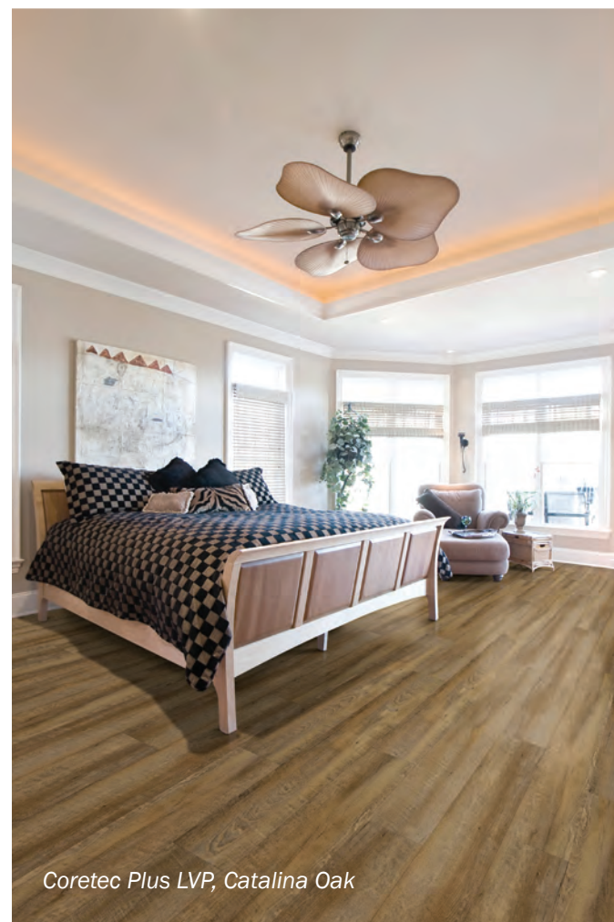
Coretec Plus LVP, Catalina Oak