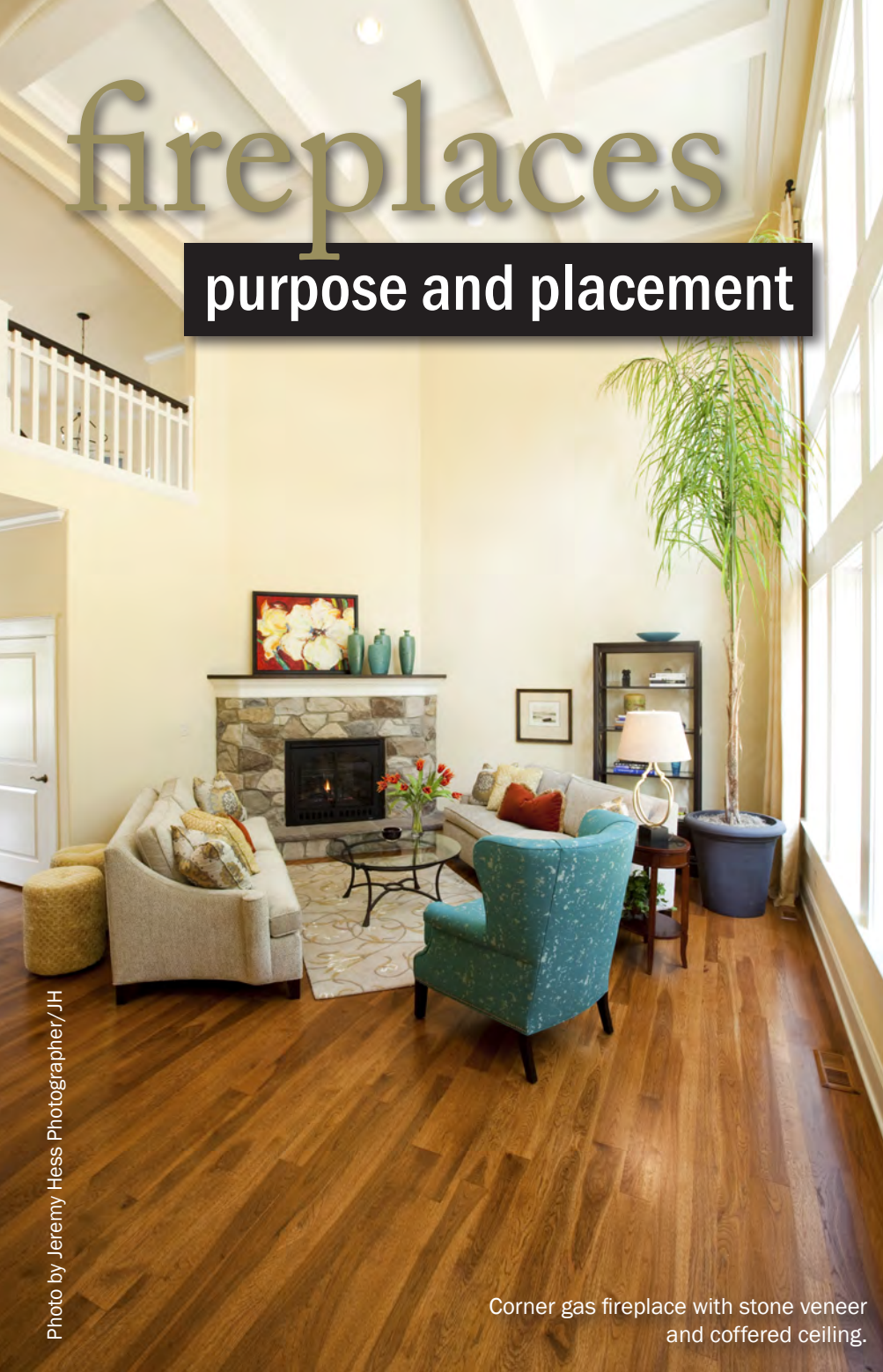
Corner gas fireplace with stone veneer and coffered ceiling.