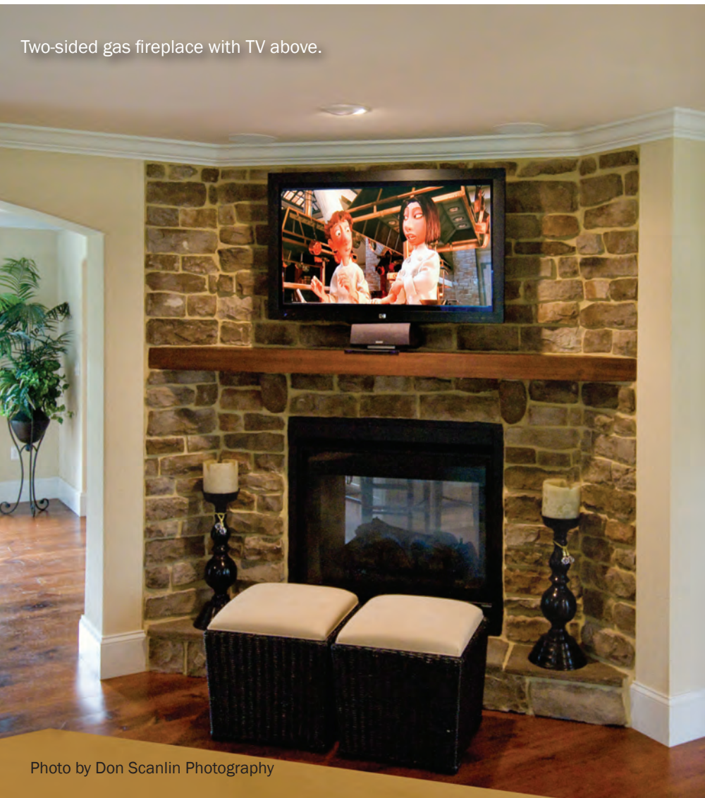
Two-sided gas fireplace with TV above.