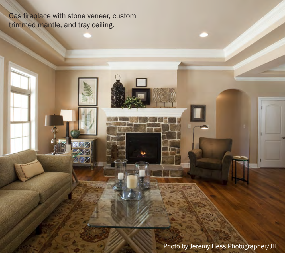
Gas fireplace with stone veneer, custom trimmed mantle, and tray ceiling.