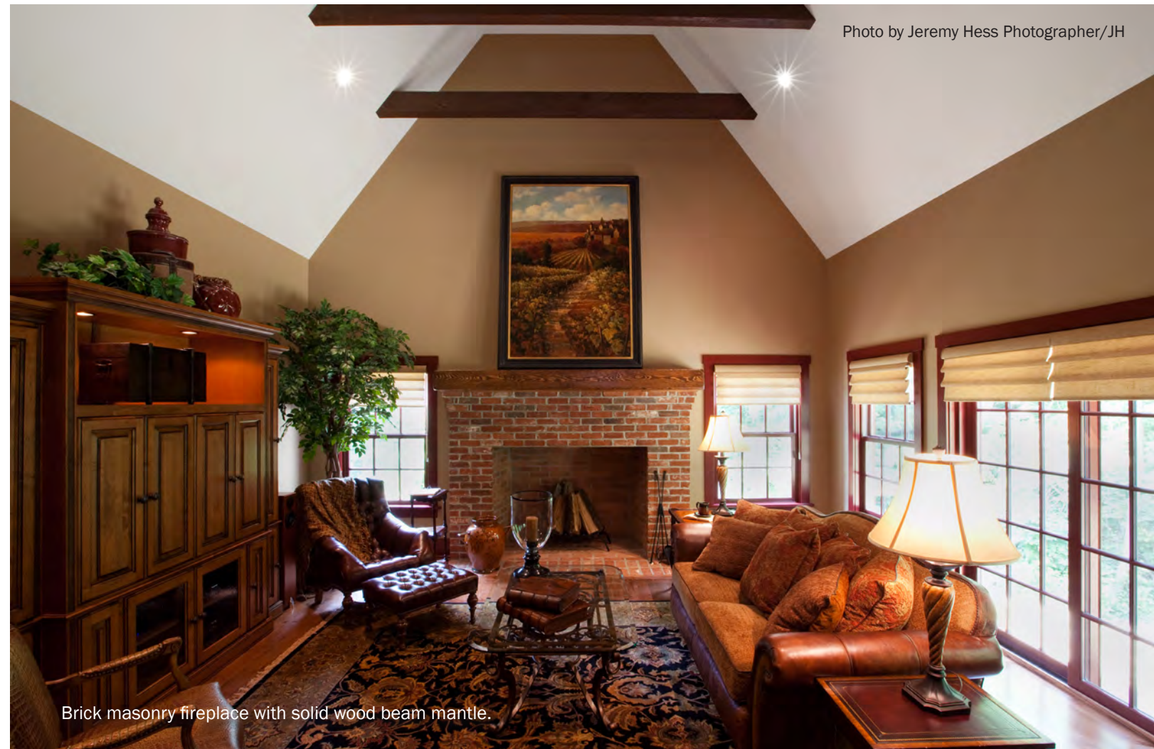
Brick masonry fireplace with solid wood beam mantle.

In the mist of summertime warmth, I'm sure thinking about a fireplace is probably the last thing on your mind. However, if you are considering the possibility of an addition or renovation at your home this fall then right now is the ideal time to be contemplating your options for a fireplace.