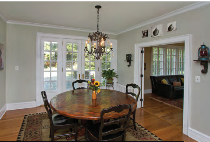
To see BEFORE photos of this job (and more AFTER photos), go to JoelsPainting.com .