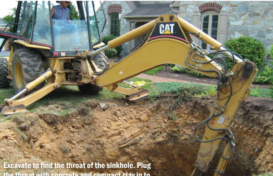
the throat with concrete and compact clay in to eal the area at the hole. Finish grade and seed to estore to original condition